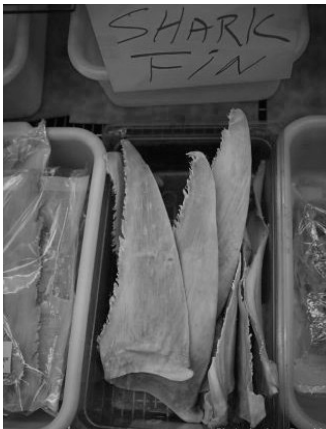
Shark fins for sale.

It has established that blue whales are the strongest, in terms of the absolute amount of force they can generate. They are stronger than other large whales, including the massive sperm whale, the largest toothed cetacean, although they are not the strongest relative to their body size.