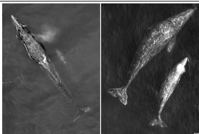
Blubber is crucial for survival: the skinny mother on the left may not have enough reserves for her to reach the Arctic while nursing her calf.

The height of the hexacopter is a key concern, because whales and other marine species are sensitive to disturbances in their environment. So the contraption is fitted with a precise altimeter to monitor