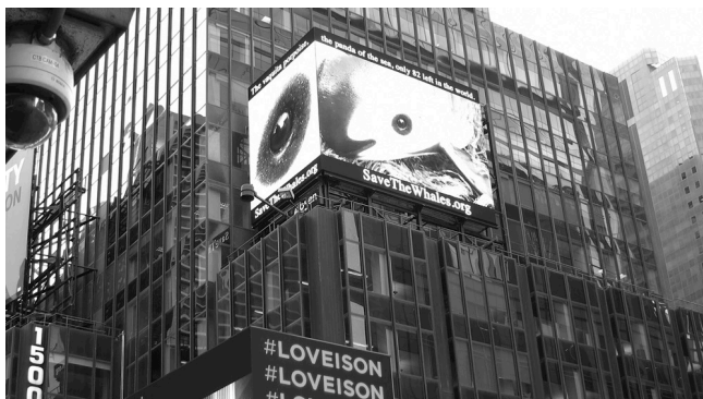
Vaquita on display on digital banner in Times Square.

To see the banner in motion, visit http://www.savethewhales.org/vaquita82_Times-Square.html .