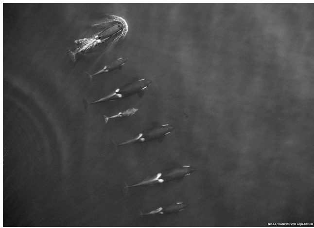
Dr Durban's team also used drones to observe killer whales - like this family of seven.

how high it is. That helps with analysing the pictures, but also means it can keep a safe distance.